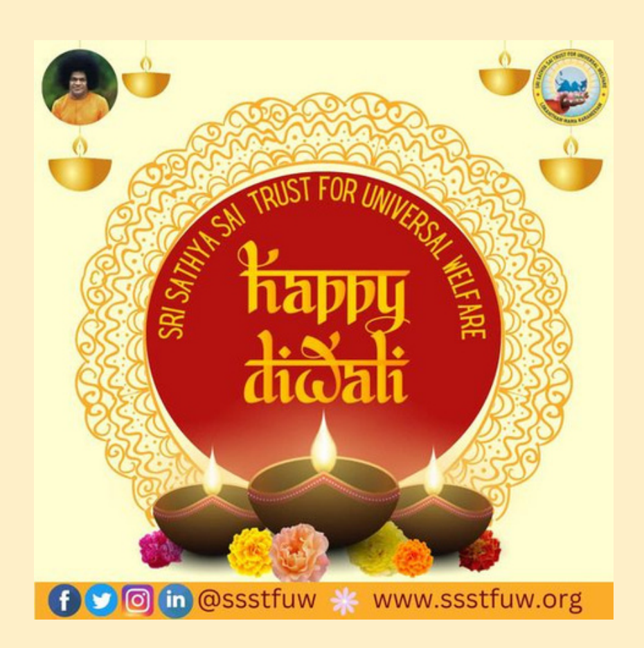
On the holy occasion of Diwali, Bhagawan Baba blessed with the following Benedictory Message to one and all:

'Deepavali is a festival which is designed to celebrate the suppression of the Ego by the Higher Self. Man is plunged in the darkness of ignorance and has lost the power of discrimination between the permanent and the evanescent. When the darkness of ignorance caused by Ahamkara (the ego-feeling) is dispelled by the light of Divine knowledge, the effulgence of the Divine is experienced.'