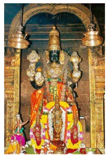
DIVYA VAARADHI | OCTOBER 2021 EDITION